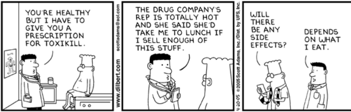
© Scott Adams, Inc./Dist. by UFS, Inc.